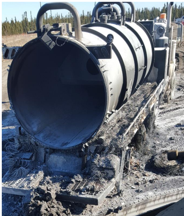
Destroyed Vacuum Truck

A vacuum truck operator was in the process of unloading cold heavy crude when he noticed that the 6-inch rubber hose downstream of the blower was smoldering. The truck operator proceeded to discharge his fire extinguisher on the hose and then turned off the blower and closed the truck and tank valves. Shortly thereafter a loud popping sound was heard and then the truck operator was engulfed in flames. While the operator was running away from the area the rear door on the vacuum truck blew off hitting the production tank and platform. The vacuum truck was completely destroyed and some damage to the production platform was sustained. The operator was wearing fire retardant coveralls and a 4-head gas monitor and suffered third degree burns requiring a skin graft.